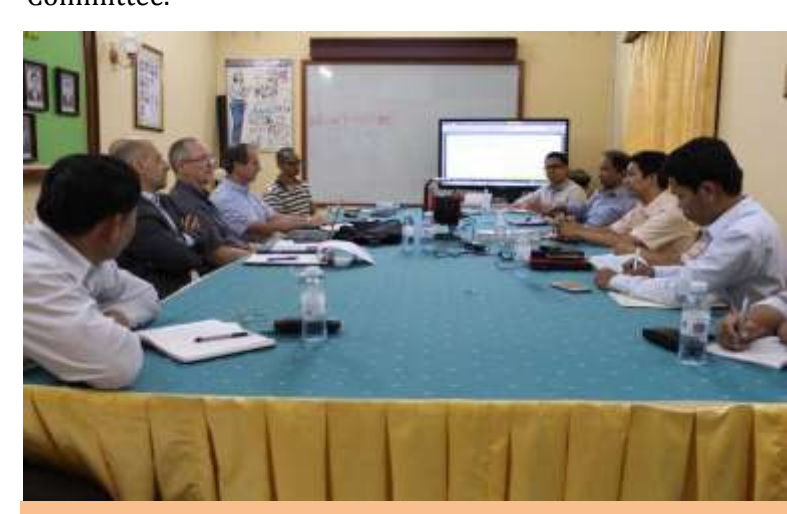
On 28th May 2014, a discussion about election dispute resolution (EDR) with IFES's expert

COMFREL, with ERA members, had regular meetings, about 67 times, to talk about proposed amendments on the legal framework related to electoral management body and electoral dispute resolution mechanism, the recommendations on election reform and the National Election Committee.