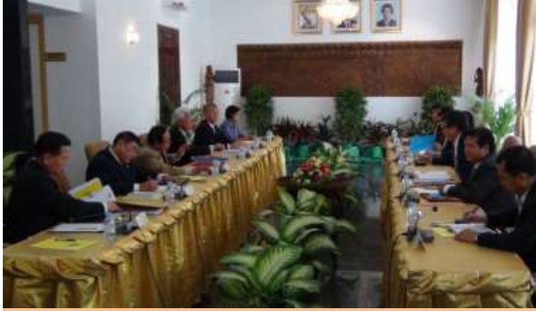
Picture 6: A meeting between the ruling party and CNRP on electoral reform at the Senate on 03 March 2014