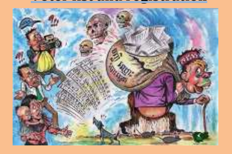
Voter list and registration