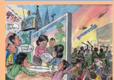
State control over the media