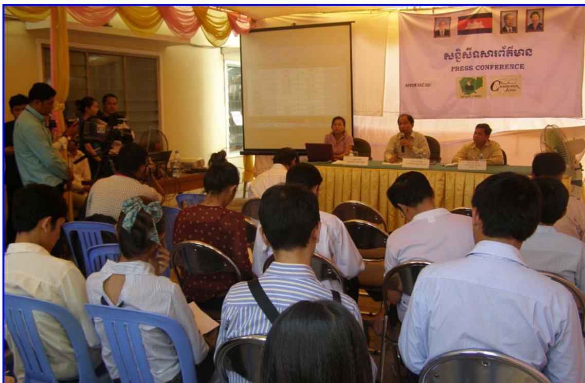
COMFREL is holding a press conference to inform the public about 2012 commune council election-related information at its head office in Phnom Penh.

The purpose of these workshops was to present COMFREL's finding reports to the public, especially to the NEC, the National Assembly, political parties and other electoral stakeholders to increase their awareness of the election process and election irregularities. COMFREL also took the floor to seek their recommendations to deal with election irregularities for the sake of fairness and integrity for future elections.