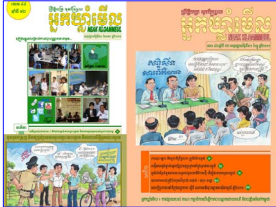
COMFREL Neak Kloam Meul Bulletin

COMFREL's Media Unit produced two series of Neak Kloam Meul Bulletin, Volume 46 and 47. 3,970 copies of the Volume 46 were published and distributed to NGOs, CSOs, universities, COMFREL-organized workshop participants, embassies, and its networks. The main themes of these bulletins include the following topics: