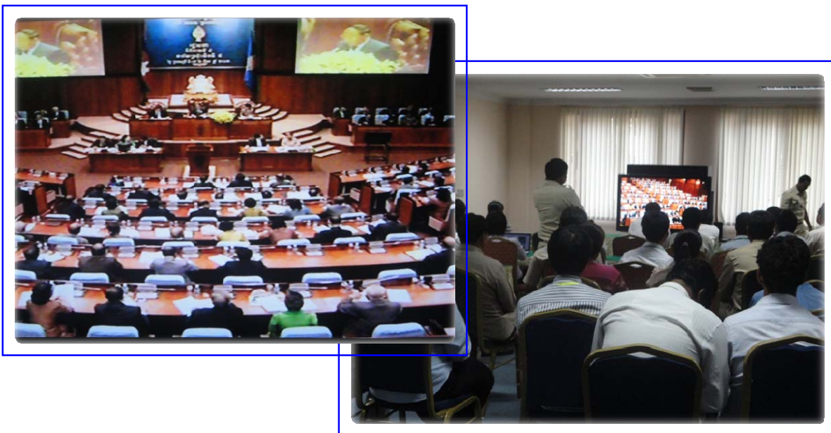
Two Monitoring Unit Assistants observe National Assembly (NA)'s debate sessions at the NA hall and the press room inside the NA building.

During the entire year covered by this report, COMFREL observers attended the National Assembly sessions to observe the function of the Assembly and the matters that were discussed. Two Monitoring Assistants observed plenary sessions of the NA that debated and adopted 15 agenda items. Among them, 12 were draft laws, five were votes of confidence, two were the mission and activity reports of members of the Parliament, and one was a letter by the King.