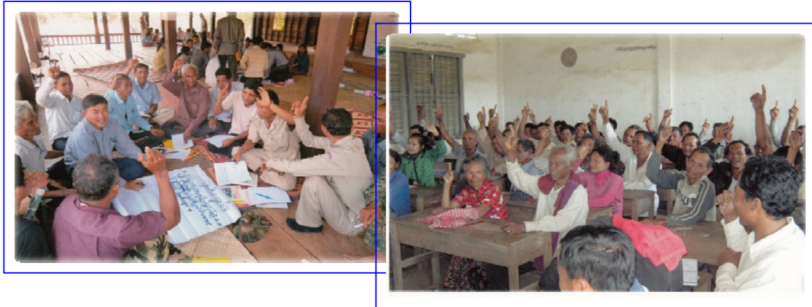
Activities of Workshop participants in setting up their local agenda of five priority needs during COMFREL-organized Voter Voice Workshops in Remote Commune in 201

The workshops used the methodology of group discussion and voting to prioritise the agendas. In the full-day workshop, the workshop facilitator divided the participants into three plenary groups to discuss and their five most important needs within their commune they wish to address. The facilitators provided some ideas and information related to the topic that each groups members were discussing and ensured participation from every member. During discussion, each group identified five agendas with precise indicators. This means that they had to produce precise indicators for their communes such as: What do they want? Where and when do they want it? How many do they want? What quality do they want? How will this be done?