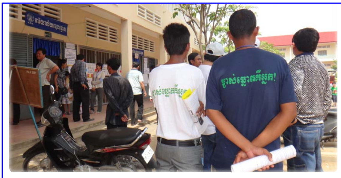
Two COMFREL election observers are observing election activities on a polling day of the 2012 commune council election in Phnom Penh.