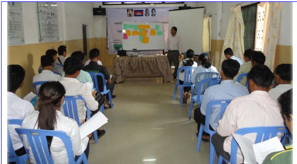
COMFREL is providing a follow-up training course on Citizen Score Card to 26 (7 female) local network members on 20 September 2012 in Phnom Penh.

The contents of the follow-up training included the citizen score card (method on evaluation and introduction such as interview, interviewers, target group and evaluation form) and introduction to the functions of mobile phones (sending SMS via mobile phone).