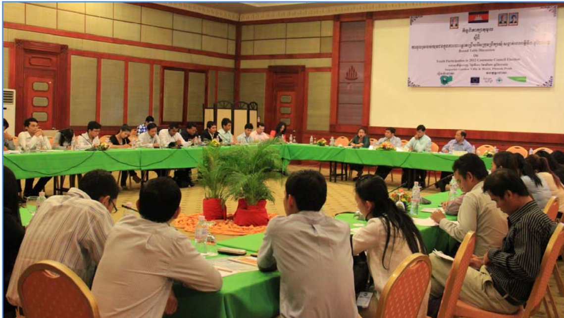
80 participants join COMFREL round table discussion on “Youth Participation in Third Mandate 2012 Commune Council Election Process” at the Imperial Hotel on 10 August 2012.

10/08/2012: COMFREL conducted a round table discussion on “Youth Participation in Third Mandate 2012 commune council election process” at the Imperial Hotel, with a total of 80 participants including representatives of national and international NGOs, students from some of the universities in Phnom Penh, as well as national and international press media.