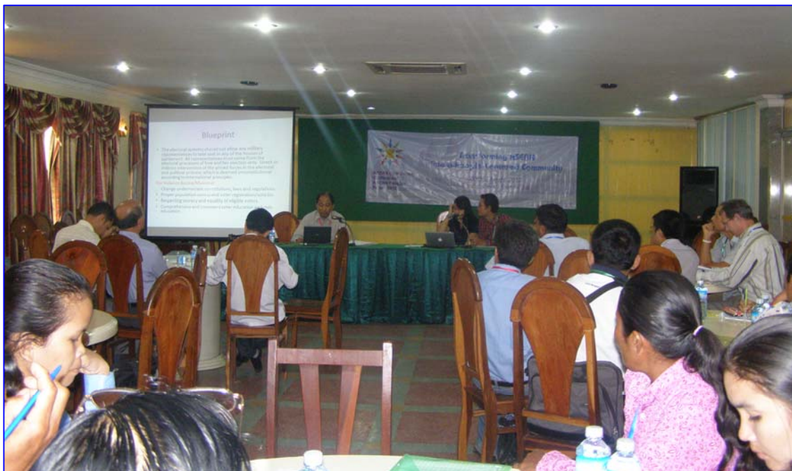
A Thematic Workshop on “ASEAN Electoral Community” is co-organized by COMFREL, NICFEC, ANFREL, and other CSOs on 30 March in Phnom Penh.

The forum took place in Phnom Penh on the 29-31 March 2012. The event, attended by over 1200 delegates, provided a unique networking opportunity for civil society organisations from the ten ASEAN nations to discuss ASEAN processes and common issues facing their people. These 1,200 delegates came from ASEAN and other non-ASEAN member countries