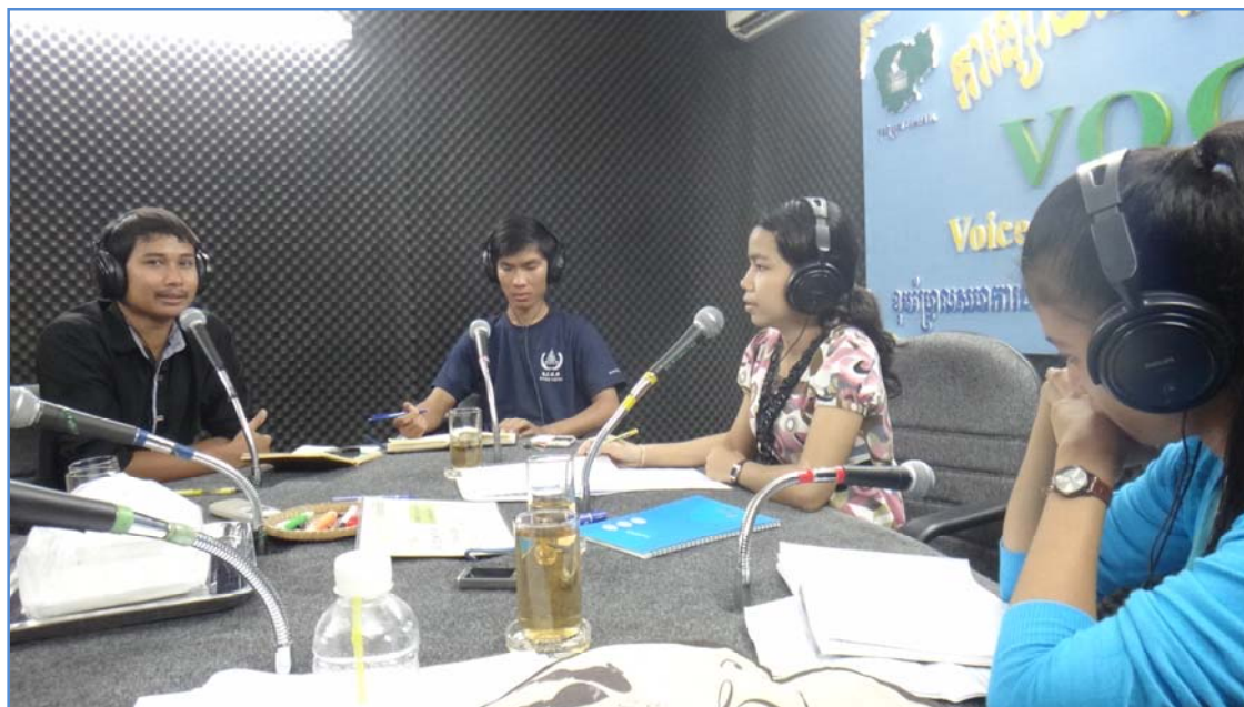
COMFREL's daily radio broadcasting named Voice of Civil Society airs live every morning from 7:30 to 8:30 am.

The total number of live aired and rebroadcast radio programs during this period was 366 (live 235 and rebroadcast 131). The table below shows the number of times VoC programs were broadcast, both live and rebroadcast, in each month via FM 105 station in Phnom Penh.