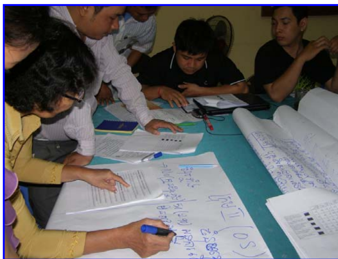
23 COMFREL staff members are assessing its organizational development on 14 August 2012 at the COMFREL office.

14/08/2012: COMFREL conducted a whole-day Partnership Organizational Capacity