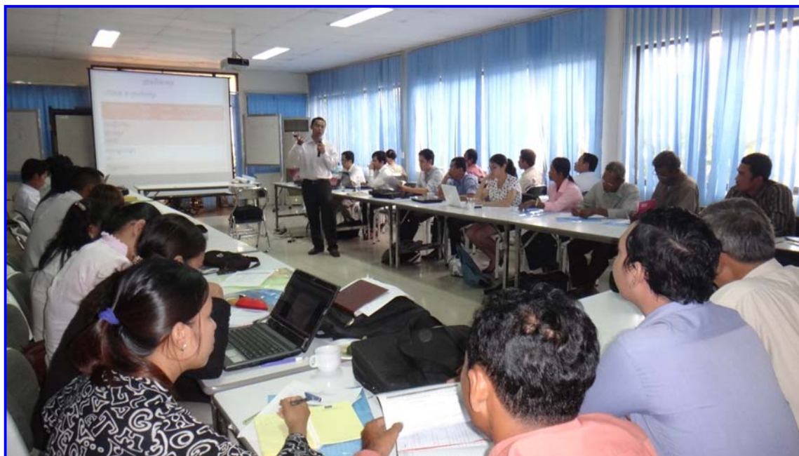
48 (20 female) participants comprising COMFREL central staff members, provincial secretaries, district contact persons and commune activists attend a full-day reflection meeting on the 3 rd commune council election observation on 10 July 2012 in Phnom Penh.

The reflection was focused on four main issues: recruitment and deployment of election observers, training, cooperation with national and international Non-Governmental Organizations (NGOs) and reporting. All findings related to strengths, weaknesses, lessons learnt, and recommendation were compiled into separate reflection meeting minutes.