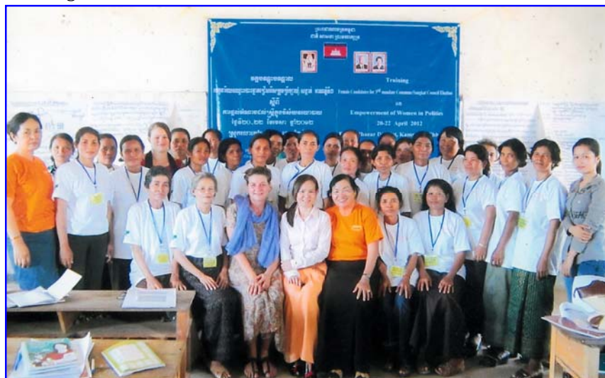
30 female political party candidates standing in the 2012 commune council election participate in COMFREL-organized training in Empowerment of Women in Politics from 20 to 22 April 2012 in Kampong Chhnang province.

COMFREL provided three capacity development training sessions to 90 female political party candidates from all participating parties in three provinces: Kampong Chhnang, Takeo and Kampong Cham. The training aimed to strengthen capacity of female political party candidates standing in the 2012 commune council election with six main themes: