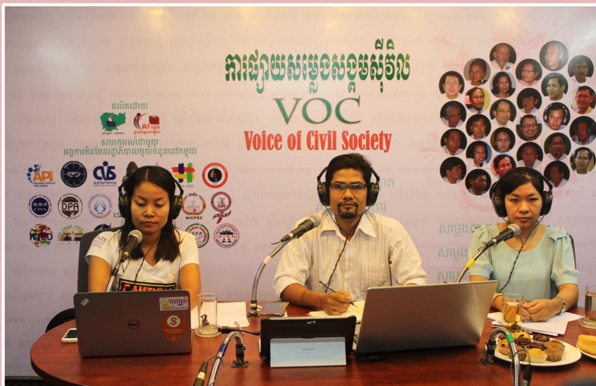
‘Women Can Do It’ radio programme on “Young Women Forum” on 03 November 2016