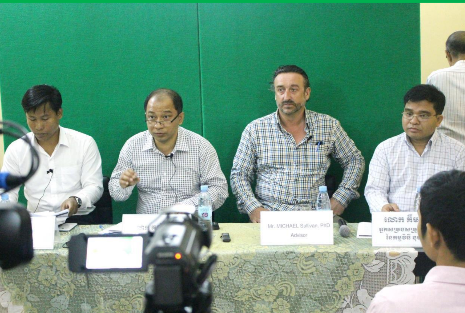
The 2015 reports on Democracy, Elections, and Report in Cambodia was launched on 29th March 2016 at COMFREL's office

COMFREL also produced 21 recommendations regarding regulation and procedure for voter registration and procedure for selecting a secretary general, deputy secretary general. One recommendation related creating a voter registration group in remote village, the authority right to question and verification on the legitimate documents for those who are suspicious of unable to speak Khmer correctly and the rights to vote and stand for election for those who are in condition of pre-trial and convicted. These recommendations were sent to NEC.