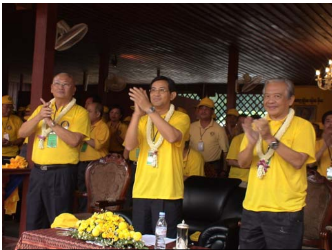
សមាជិកសមាជិកព្រឹទ្ធសភាស៊ីម ភូមិ ១០ តុលា ២០០៦

karRobTspayépkjKNbkShú sibic enAeBI enal kanEt beglie [manbBaéChEfm eTot edaysarEtCemahfákdknaépkjGs; ry 3 eBI dýtd ehly)annaV RBHGgáas; rNbE 3 Rtú)anTmekBitENg. neya)ayena kúRbeTskm&a)anbnFIC skmCnsMLg CMas;TTV rgeKahCaech edaymanGkmY cMhTTV rgeKahfákI Cvirbsxú. Ca ]TahrN_ Béf 3 1 Extul a qám 2006