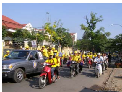
គណបក្ស ហ្វ៊ុន ស៊ិនប៉ិច