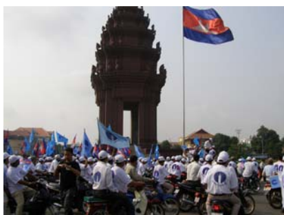
គណបក្ស សម រង្ស៊ី